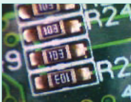
PC board inspection