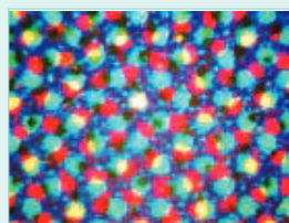
Analysis of printing