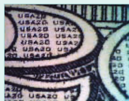
Check for counterfeit money